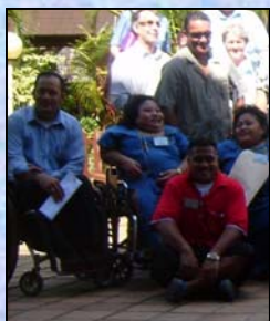
Nofo and some NOLA staff at the PDF Council Meeting 2008 at Samoa.