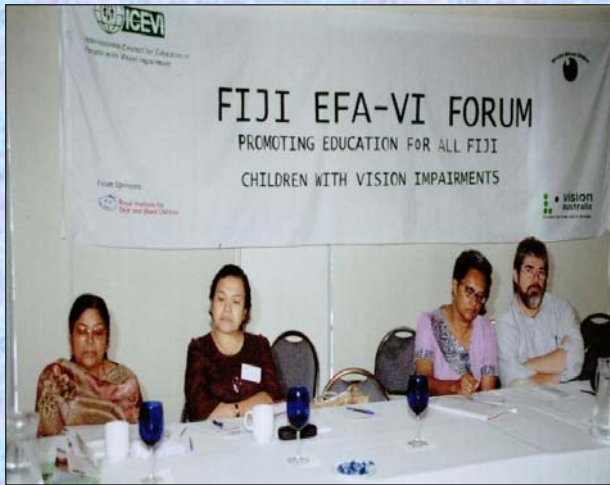
Participants of the Fiji EFA—VI Forum at Tanoa Plaza, Fiji on the 6th—8th of October, 2008

Pacific country selected by ICEVI and WBU for implementation of the “Education for all children with vision impairments” (EFA-VI) global campaign.