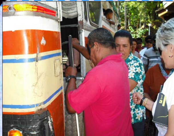
Learning to use the long cane under blindfold on buses. One participant is under blindfold, while the other is learning how to teach this skill.

difficult weather conditions in challenging city and rural environments. Moreover, being a competency-based course, participants were also required to demonstrate skills and complete challenging assignments including an in-country assignment in English which is, for the majority of participants, their second or third language.